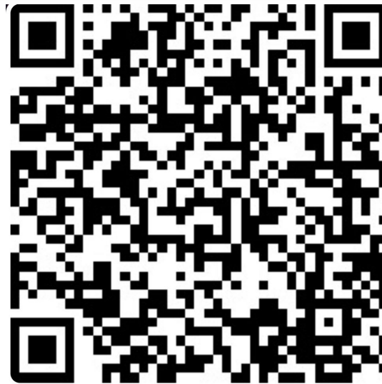
CoARA-ERIP Membership Sign-up QRCode