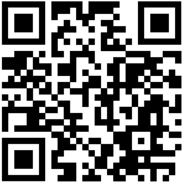
CoARA-ERIP Organization & WP QRCode