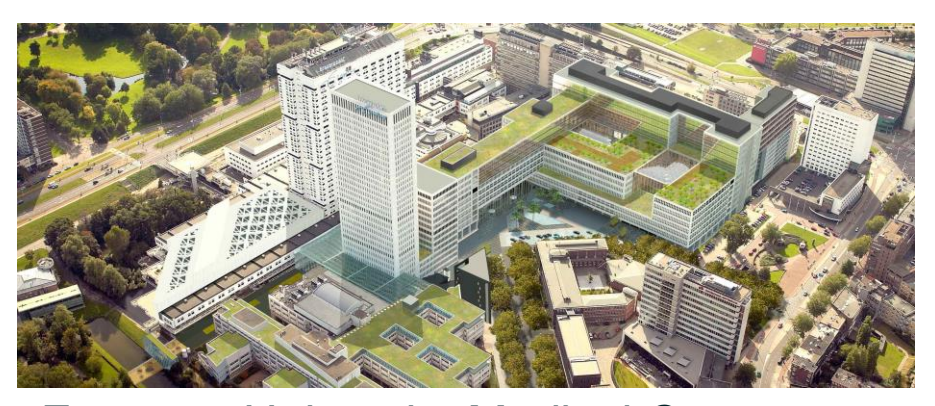
Erasmus University Medical Center