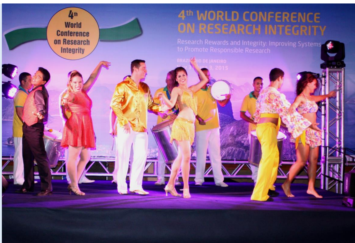
Figure 9- Samba Show

At the end of the event, participants were asked to make a critical assessment of the 4WCRI.