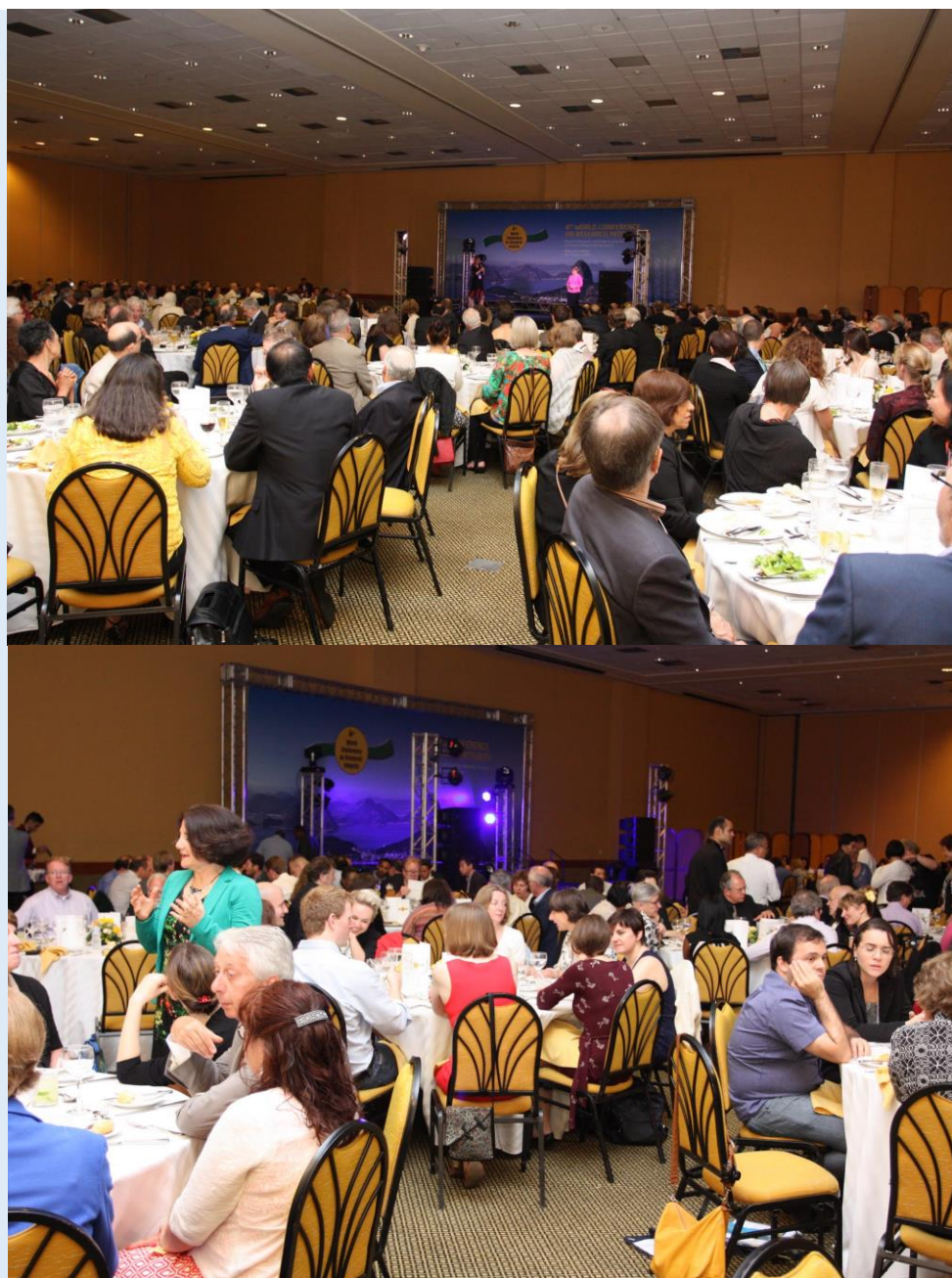
Figure 8- Gala Dinner