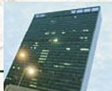
The U.N.'s Intergovernmental Panel on Climate Change relied heavily on the flawed work of these scientists.

These five, though far from being the only ones, are among the top perpetrators of the Great Global Warming Hoax.